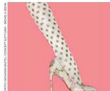
Salomé tights, Marie Antoinette Santoni – Rubelli shoes