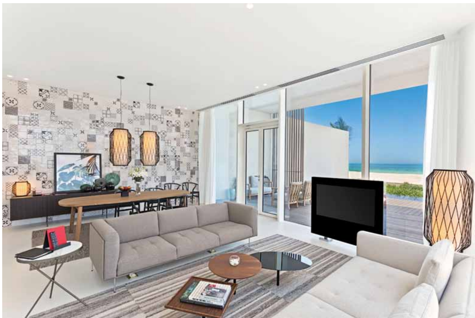
Kohinoor suite living room

The renowned Lissoni Associati firm was selected because of the founder's unparalleled ability to speak to every design detail, as well as his experience creating world-class hospitality experiences – including his contemporary Conservatorium Hotel in Amsterdam's museum district, the MarePineta resort in Milano Marittima, the Roomers hotel in Baden-Baden, the Bellariva hotel at Lake Garda, the Mamilla hotel in Jerusalem, the Swire hotel in Shanghai and the Monaco & Grand Canal hotel in Venice.