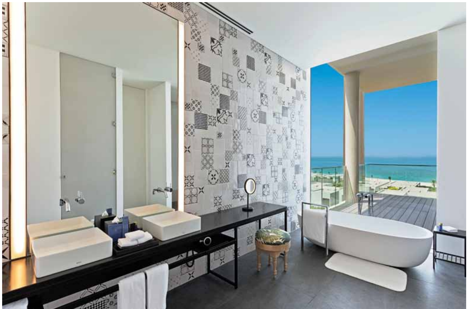
Kohinoor suite bedroom and bathroom