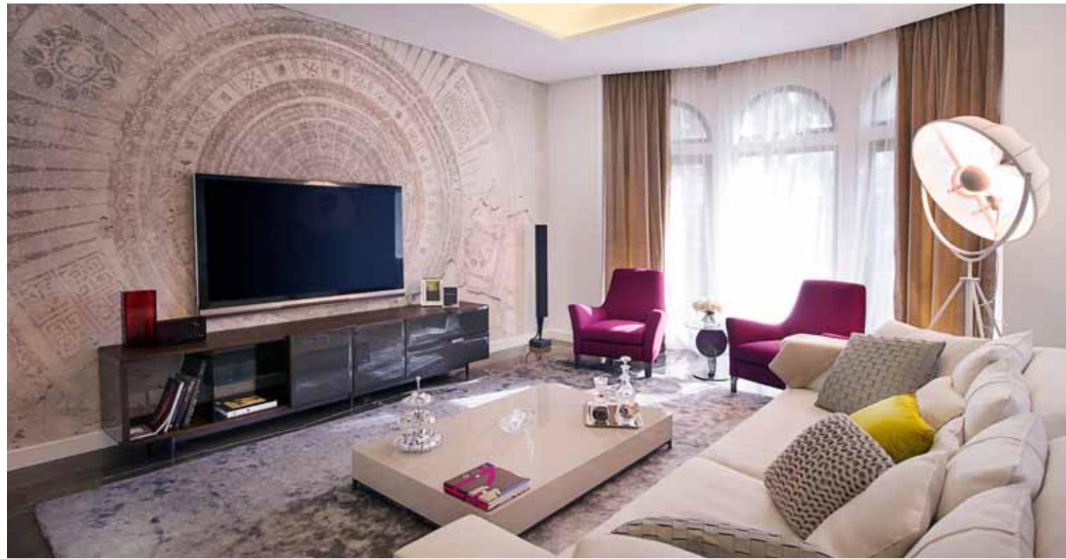
The living room: sofas from Bulthaus, armchairs and furnishings from Minotti, Wall&Deco wallpaper, Viabizzuno & Pallucco flooring.