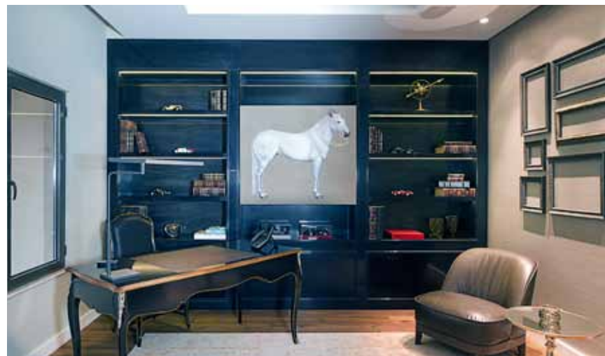
The study features a desk and chair by Selva, custom bookcases and storage, and Viabizzuno and Karlbox desk lamp.