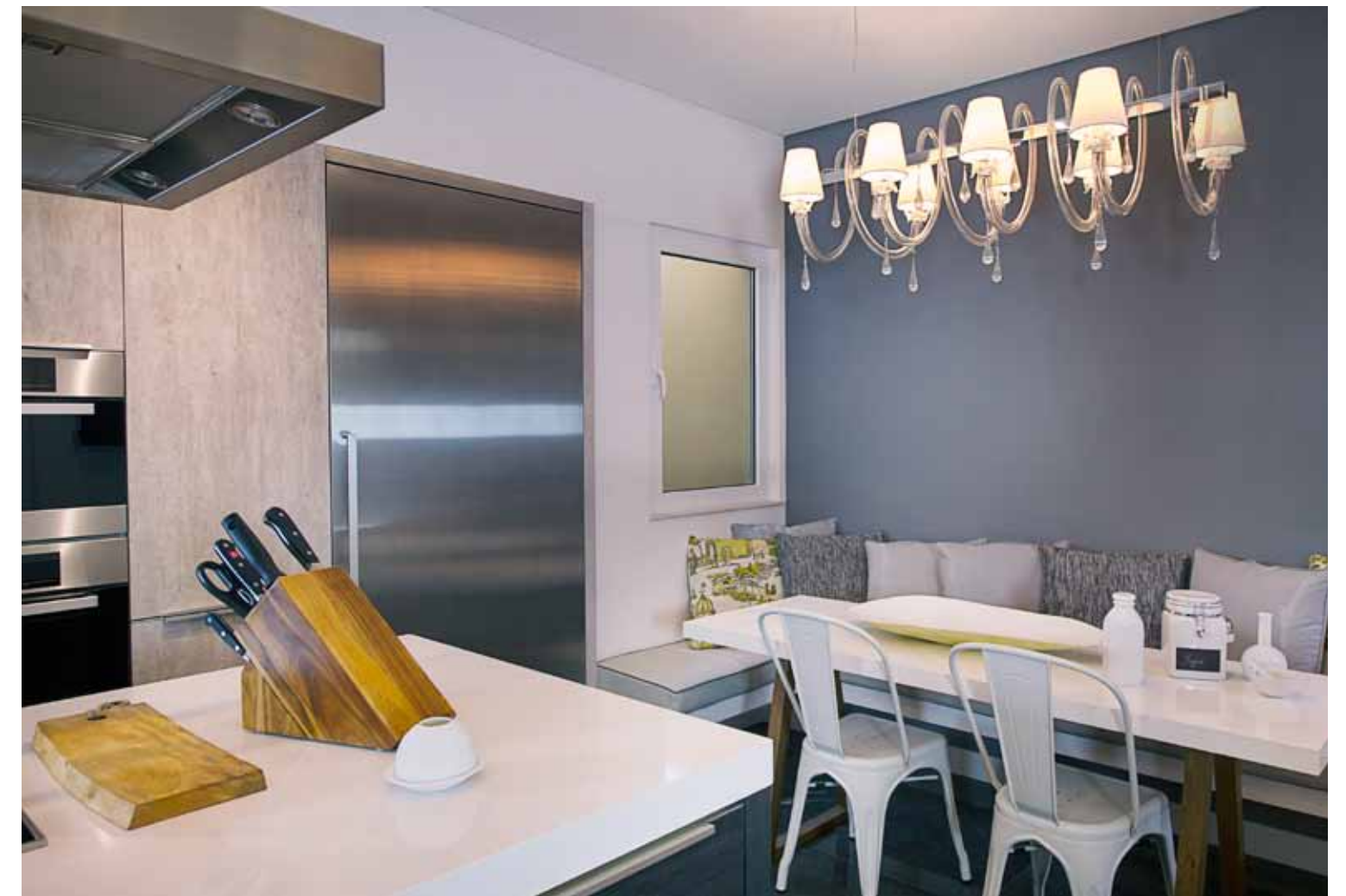
The kitchen features appliances by Miele, units by Hacker, grey marquina marble, and lighting by Viabizzuno.