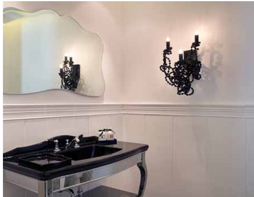
The guest washroom features fixtures by Devon&Devon and a Viabizzuno and Van Egmond wall lamp.