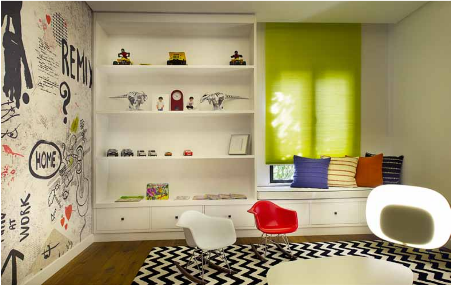
A colourful and vibrant child's room.